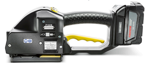
P328 Battery Powered Plastic Strapping Tool

Let us be your source for all of your strapping needs.